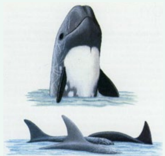
ABOVE: Grey Dolphin in lookout posture, showing the prominent crease in the forehead.

Maximum sizes vary from 3.8 m for males and 3.66 m for females and they have a life span of some 30 years.