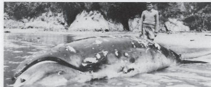
Pygmy Right whale ( Caperea marginata ), stranded at Port Underwood, N.Z. January, 1966.

They are mostly known from strandings in South Africa, Australia and New Zealand and are seldom seen at sea, probably because they do not spend long periods exposed on the surface, and when they do emerge, the dorsal fin is often not shown, the blow is small, and the whales do not indulge in the spectacular behaviour that is characteristic of other whales such as that of the Humpback seen in Cook Strait this June.